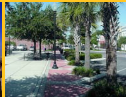
Zephyrhills/Dade City/ New Port Richey