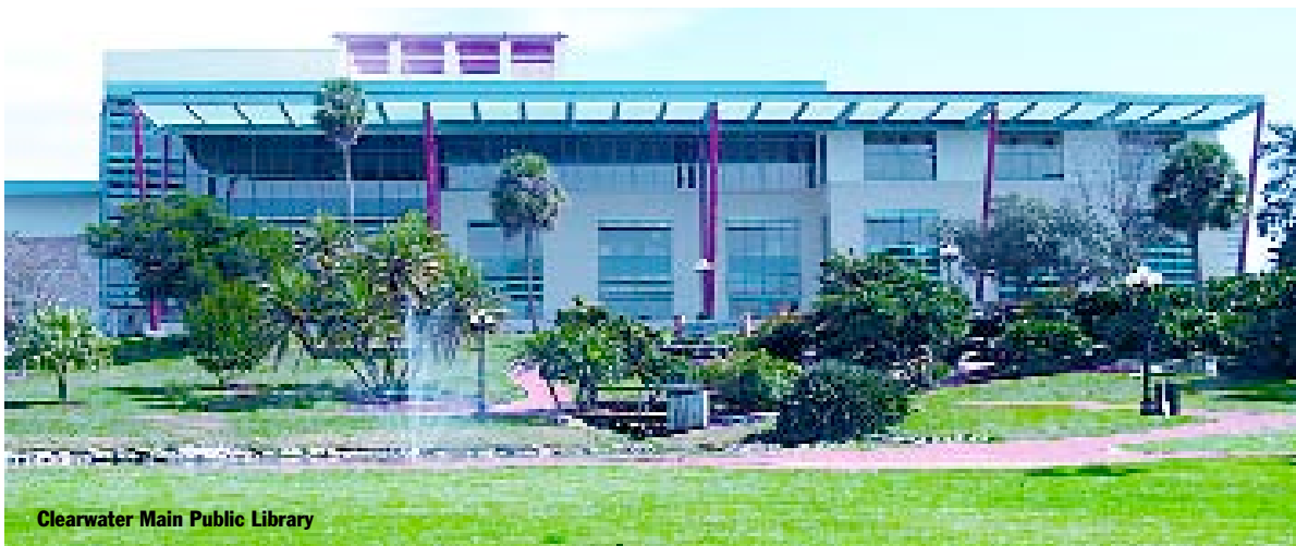
Clearwater Main Public Library

In Clearwater, developers don't have to fight City Hall. In fact, City Hall is willing to relocate if the right project comes along to further revitalize downtown.